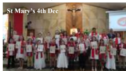
St Mary's 4th Dec