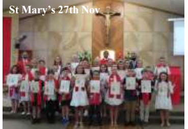
St Mary's 27th Nov

Congratulations to our candidates! All of our candidates have now received the Sacrament. A big thank you to the Families, Sacramental Leaders, Teachers and School Principals, and most of all THANK YOU to the wonderful children who showed such resilience in adapting to the online classes and very patiently waited for the ceremonies to be rescheduled. The Holy Spirit is alive in each of you! Here are some photos from our ceremonies and you will find more on our Parish Facebook page.