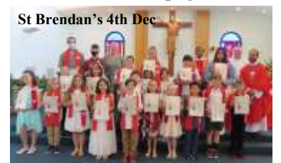
St Brendan's 4th Dec